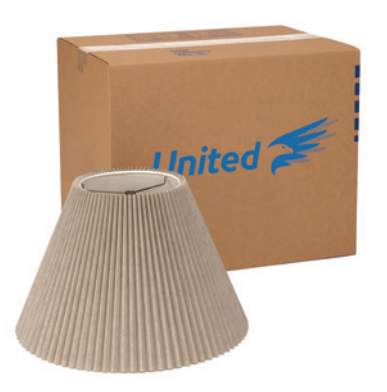
4.5-cubic-foot box 24" x 18" x 18"

Telescoping boxes are designed to fit almost any mirror or picture.