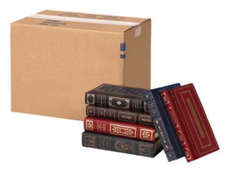
1.5-cubic-foot box 16" x 12" x 12"

This small box is ideal for heavier items such as books, records, CDs and canned goods.